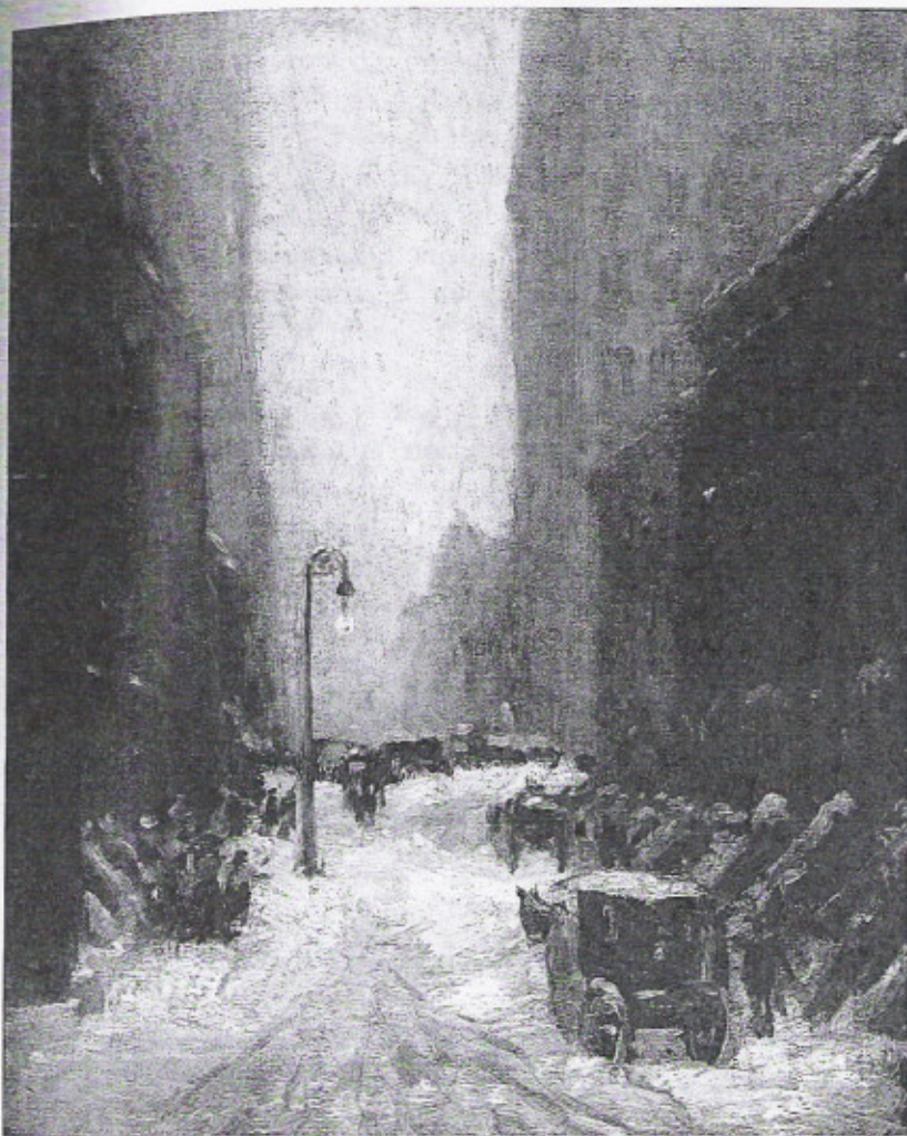
Snow in New York (1902) by Robert Henri. Oil on canvas (32" x 25 3 / 4 ").